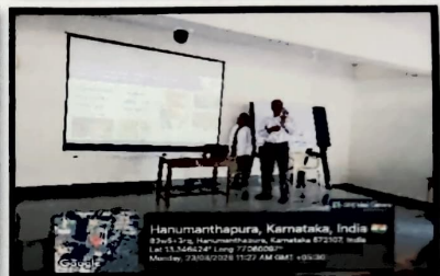
Hanumanthapura, Karnataka, India 8365-312 Hanumanthapura, Karnataka 572107, India Lat 13.346432° Long 77.082028° Monday, 23/03/2025 11:22 AM GMT +05:30