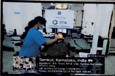
Tumkur, Karnataka, India 8365-312 Hanumanthapura, Karnataka 572107, India Lat 13.346432° Long 77.082028° Monday, 23/03/2025 02:14 PM GMT +05:30