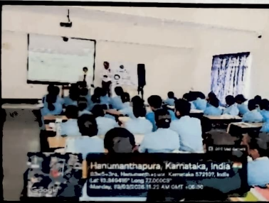
Hanumanthapura, Karnataka, India 8365-312 Hanumanthapura, Karnataka 572107, India Lat 13.346432° Long 77.082028° Monday, 23/03/2025 11:22 AM GMT +05:30