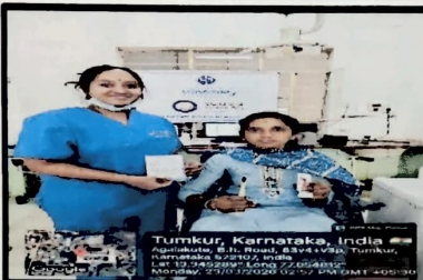
Tumkur, Karnataka, India 8365-312 Hanumanthapura, Karnataka 572107, India Lat 13.346432° Long 77.082028° Monday, 23/03/2025 02:57 PM GMT +05:30