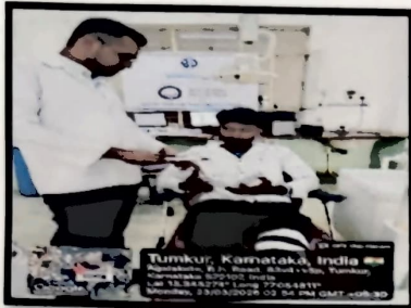
Tumkur, Karnataka, India 8365-312 Hanumanthapura, Karnataka 572107, India Lat 13.346432° Long 77.082028° Monday, 23/03/2025 02:34 PM GMT +05:30