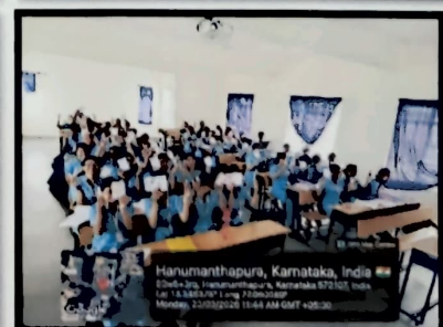
Hanumanthapura, Karnataka, India 8365-312 Hanumanthapura, Karnataka 572107, India Lat 13.346432° Long 77.082028° Monday, 23/03/2025 11:44 AM GMT +05:30