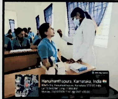
Hanumanthapura, Karnataka, India 8365-312 Hanumanthapura, Karnataka 572107, India Lat 13.346432° Long 77.082028° Monday, 23/03/2025 11:41 AM GMT +05:30