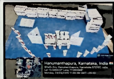
Hanumanthapura, Karnataka, India 8365-312 Hanumanthapura, Karnataka 572107, India Lat 13.346432° Long 77.082028° Monday, 23/03/2025 11:23 AM GMT +05:30