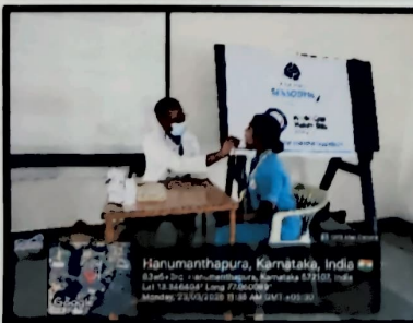
Hanumanthapura, Karnataka, India 8365-312 Hanumanthapura, Karnataka 572107, India Lat 13.346432° Long 77.082028° Monday, 23/03/2025 11:38 AM GMT +05:30