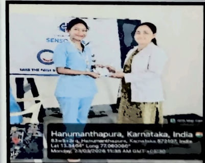
Hanumanthapura, Karnataka, India 8365-312 Hanumanthapura, Karnataka 572107, India Lat 13.346432° Long 77.082028° Monday, 23/03/2025 11:38 AM GMT +05:30