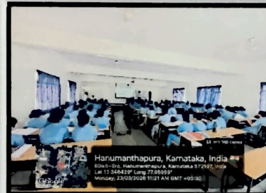
Hanumanthapura, Karnataka, India 8365-312 Hanumanthapura, Karnataka 572107, India Lat 13.346432° Long 77.082028° Monday, 23/03/2025 11:21 AM GMT +05:30