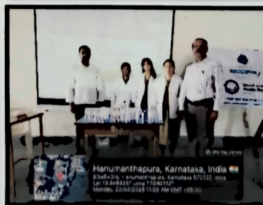
Hanumanthapura, Karnataka, India 8365-312 Hanumanthapura, Karnataka 572107, India Lat 13.346432° Long 77.082028° Monday, 23/03/2025 11:41 AM GMT +05:30