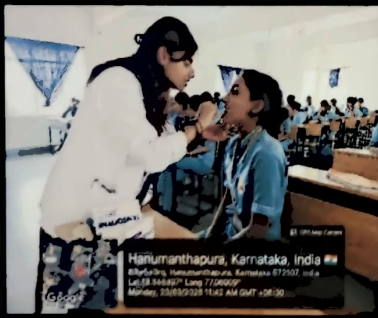
Hanumanthapura, Karnataka, India 8365-312 Hanumanthapura, Karnataka 572107, India Lat 13.346432° Long 77.082028° Monday, 23/03/2025 11:42 AM GMT +05:30